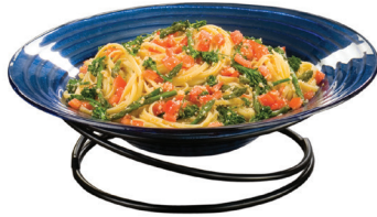
LWUS1041 shown with GBB20 bowl