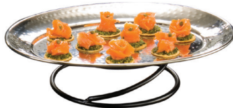
LWUS738 shown with HMRST1801 tray