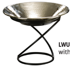
LWUS899 shown with HMRD12 bowl